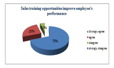
Figure 4: Sales Training Opportunities Improve Employee's Performance in Napier Healthcare Company

Answers to this question ranged between 60% strongly agree, 20% agree and only 20% disagree as shown in the above Figure. This gives an idea that employees and managers think with a big percentage of 80% that it is important to have differed types of training. It means that they are really in need of diversified training types and they have to deliver different types of training. The 20% who disagree may not be able to understand the need for having different types of training and may need more effort in raining awareness to be trained in sales.