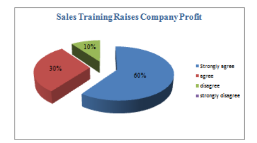
Figure 1: Sales Training Raises Napier Healthcare Company Profits

Data was collected using a questionnaire of five questions that were delivered to ten employees in the Napier Healthcare company and answers were analyzed as follows: